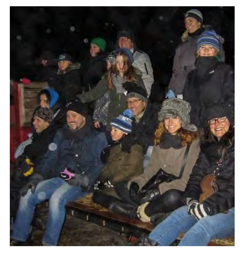
SOI Garibaldi Lodge Christmas Sleigh Ride

Over the past 34 years Garibaldi Lodge has donated over $2 million dollars to local charities.